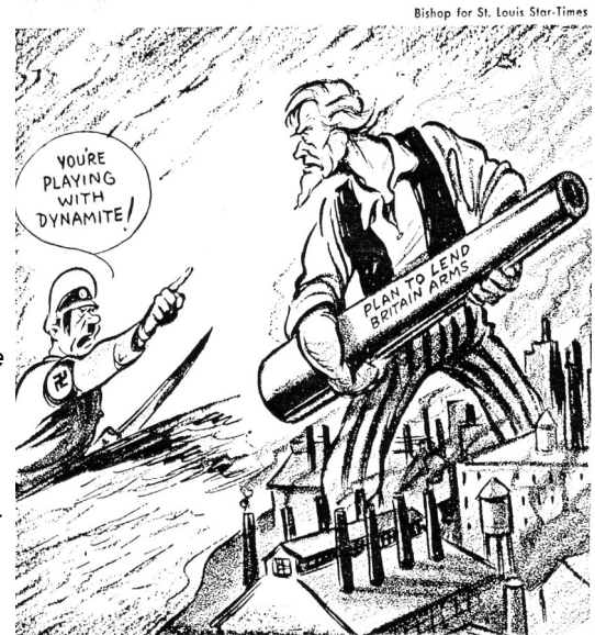
UNCLE: 'IT WOULD BE DYNAMITE IF I DIDN'T'

Pay Attention To: How Your Child Views & Makes Economic Decisions